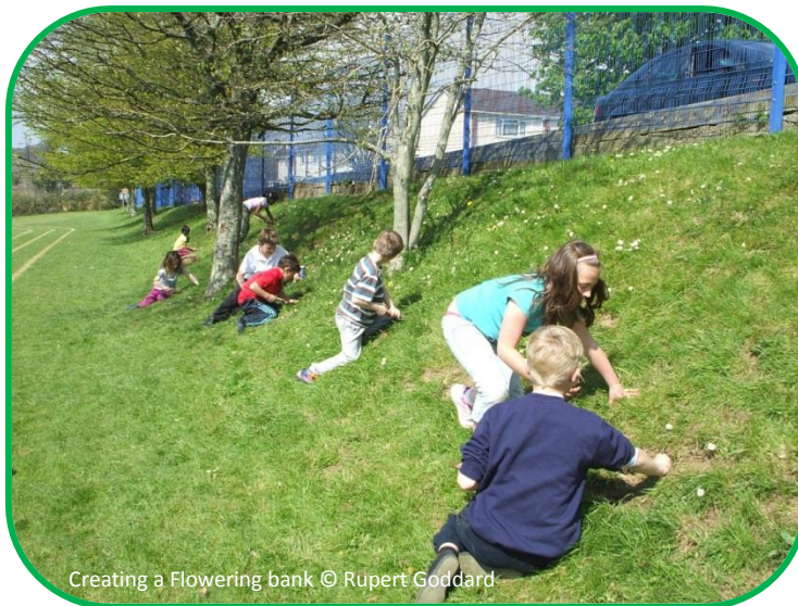
Creating a Flowering bank

Finally, join the maps together to form one giant plan of your school grounds.